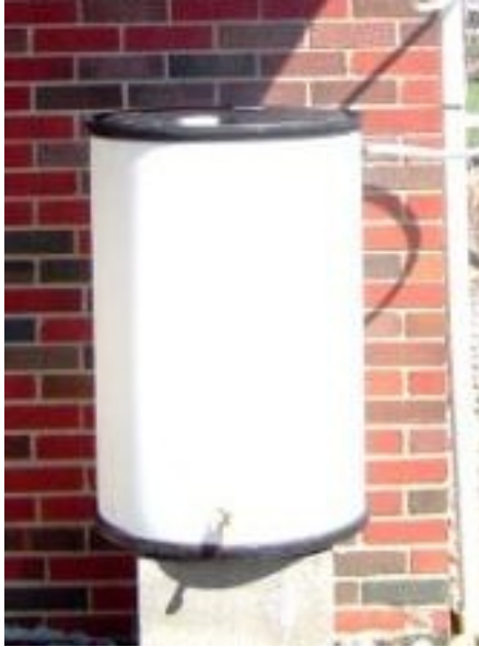
RAIN BARREL ON DISPLAY AT LYNDHURST COMMUNITY CENTER (MAY 21)